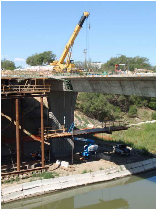
Figure 9 – Span 2 WB Segmental Construction – August 5, 2009: The 50-ton crane lifts the bottom slab formwork platform. Once the platform was hoisted, PT bars support the formwork off the strongbacks.

The rear transverse truss for the side-span traveler is installed, as the front transverse truss waits below. Work is closely coordinated with the BNSF flagger and performed in between trains passing through the jobsite.