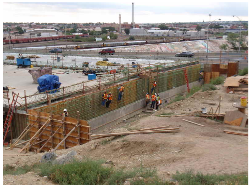
Figure 20 – Abutment 1 Backwall Construction – August 18, 2009: Ironworkers tie the backwall reinforcing, as carpenters form the wing walls. Flatiron plans to cast the backwall, backfill, cast the approach slabs, and lay asphalt approaches by mid-November.

Figure 19 - Cantilever 4 WB Segmental Construction -