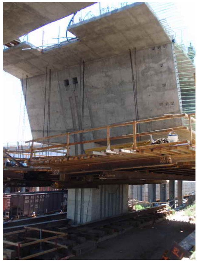
Figure 6 – Pier Table 3 EB Segmental Construction – July 27, 2009:

After the posts are removed, the falsework platform is lowered down using the winches on the deck. The block-out in the wing is to avoid the tower crane, which will be moved back to Pier 3 upon completion of Cantilever 4 WB. This blockout will be poured back after the cantilever is complete and the tower crane is removed.