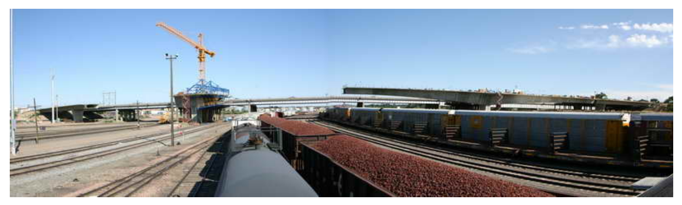
Figure 1 – Overview of the Bridge Construction – July 16, 2009:

Flatiron Constructors Intermountain began construction at Cantilever 4 WB, continued at Span 1 EB CIP Superstructure with stressing and grouting, falsework removal at Pier Table 3 EB, and placing the bottom slab and web/diaphragm portions of Pier Table 4 EB. The following is a summary of the construction progress for the last month.