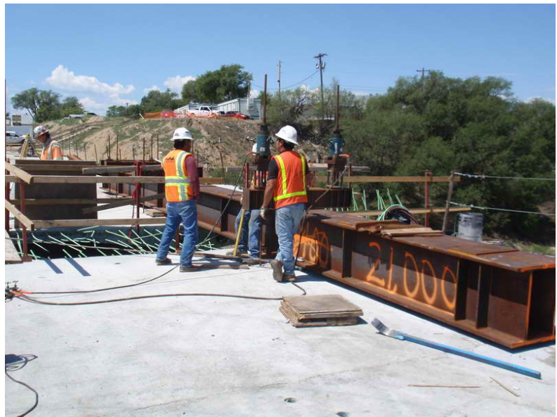
Figure 7 – Span 2 WB CIP Superstructure Construction – July 31, 2009: Workers stress the PT bars to engage the strongbacks for the closure segment, which align and lock the tips of Span 1 WB and the Cantilever 3 WB together.

After the posts are removed, the falsework platform is lowered down using the winches on the deck. The block-out in the wing is to avoid the tower crane, which will be moved back to Pier 3 upon completion of Cantilever 4 WB. This blockout will be poured back after the cantilever is complete and the tower crane is removed.