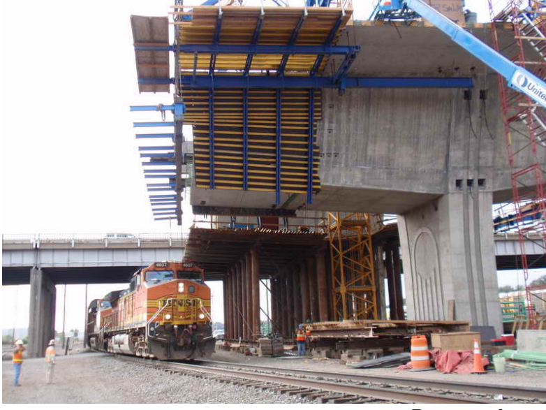
Figure 18 – Cantilever 4 WB Segmental Construction – August 18, 2009: A BNSF train passes under Cantilever 4 WB while forming continues above. Since the lower deck drive of the form traveler did not meet Railroad temporary clearance envelopes, Flatiron opted to precast the bottom slab and use it to support the web and top slab concrete. The lower deck drive will be installed for the casting of Segment W4-3E.