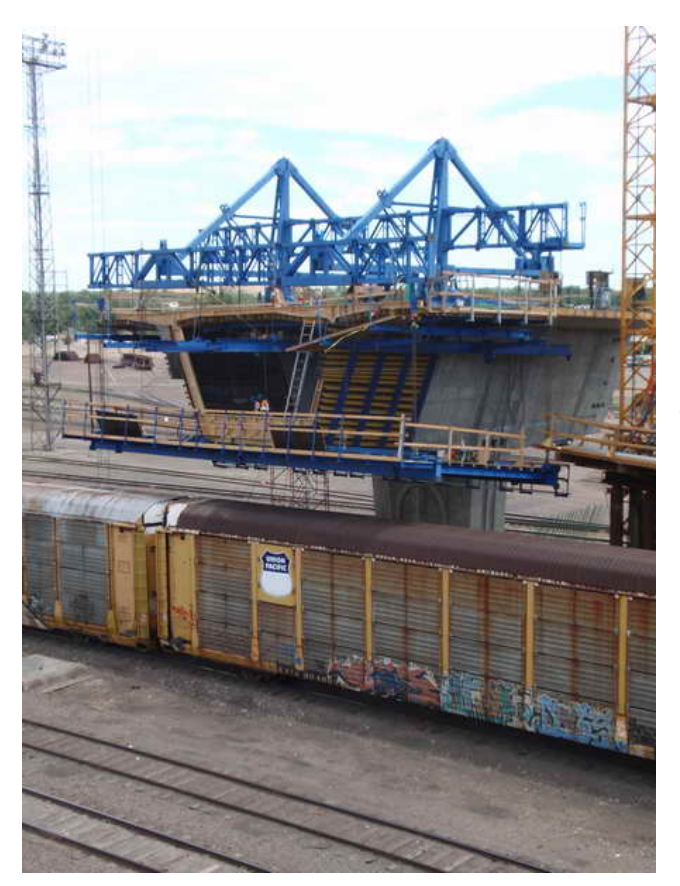
Figure 2 – Cantilever 4 WB Segmental Construction – July 20, 2009:

This photo shows an overview of the project, as seen from the Rail yard looking southeast. The main-span traveler can be seen at Cantilever 4 WB forming Segment W4-1W over the UPRR mainline tracks and the tower crane is now operational at Pier 4. The highlight on the girder on the right side of the photo is the reflection from the Arkansas River.