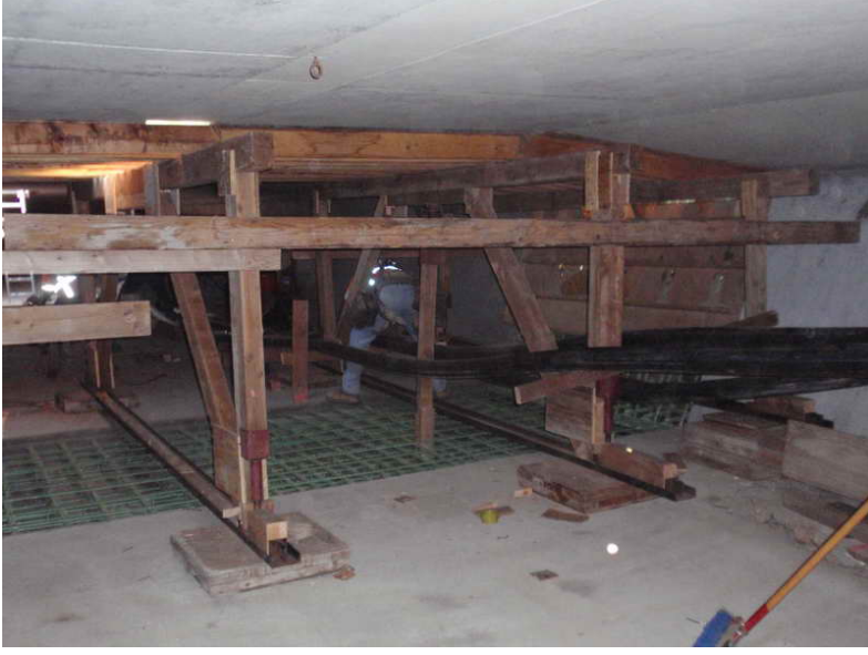
Figure 12 – Span 2 WB Closure Segment Construction – August 13, 2009: The closure segment formwork on the interior is supported off the bottom slab.