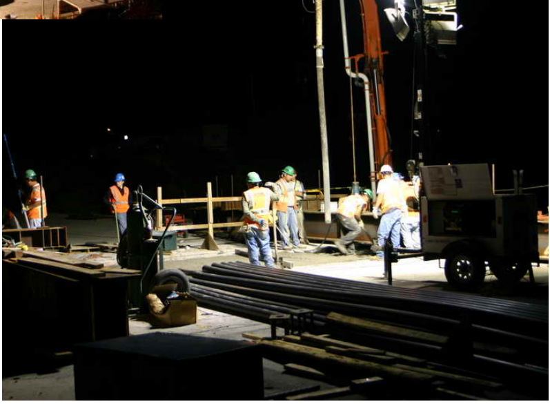
Page 6 of 10

Figure 15 – Span 2 WB Closure Segment Construction – August 14, 2009: Workers place and finish the top slab concrete for Span 2 WB closure segment.