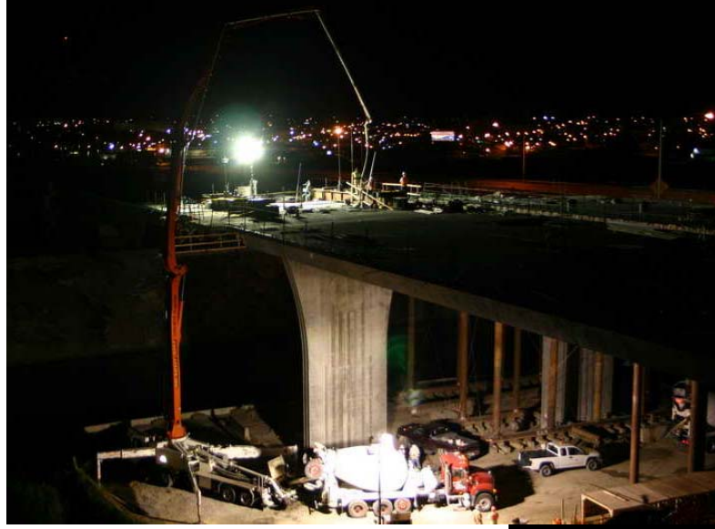
Figure 14 – Span 2 WB Closure Segment Construction– August 14, 2009: The pump truck places the concrete for Span 2 WB closure segment. Concrete placement occurs during the time when thermal gradients in the bridge are at a minimum.

Figure 15 – Span 2 WB Closure Segment Construction – August 14, 2009: Workers place and finish the top slab concrete for Span 2 WB closure segment.