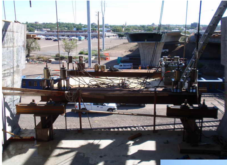
Figure 16 – Cantilever 4 WB Segmental Construction – August 15, 2009: The lifting frame is assembled and ready to pick the precast bottom slab of Segment W4-1E. Eight 100-ton jacks are connected to a common manifold for equal lifting of the slab. Flatiron originally planned to have a 240-ton crane lift the slab, but due to inherent variables between Railroad operations and the Contractor's schedule, the lifting frame saves the Contractor from having to pay for idle equipment.