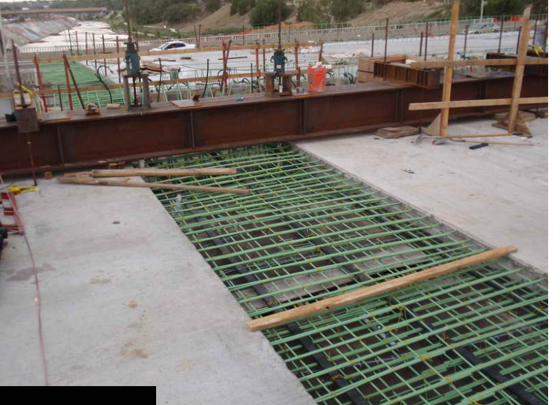
Figure 13 – Span 2 WB Closure Segment Construction – August 13, 2009: The eight-foot long closure segment is ready for concrete placement. Concrete is scheduled for 12 am.